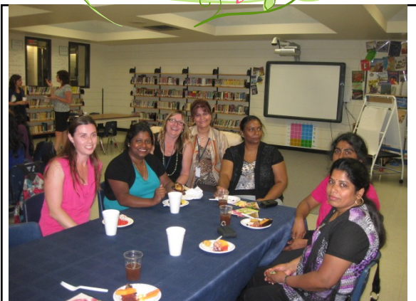
Thanking Our Volunteers!